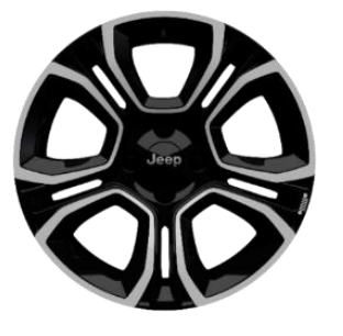
Summit Standard Wheel 18" Diamond Cut Alloy