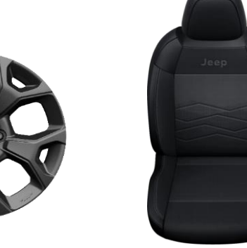
Limited Standard Wheel 16" Painted Alloy

Standard Upholstery Robin Cloth / Vinyl with Grey Accents